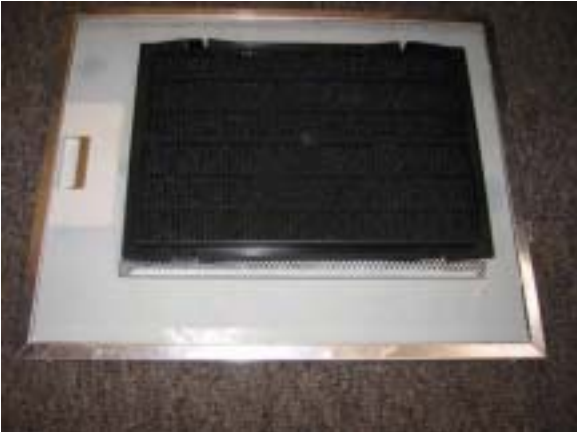
5. Installation complete.