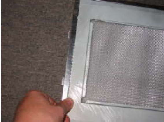
2. Push two corner tabs into metallic filter frame to lock it in. If pushing tabs in is difficult, gently lift up on the corner lip of the bracket near the gray handle and push down on the corner tab.