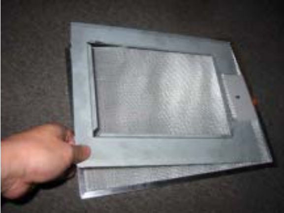
1. Install metal bracket onto metallic filter from hood by sliding one end of the metal bracket underneath the backside of the gray handle as shown above.

Follow the instructions below for installing the carbon filters to your metallic filters.