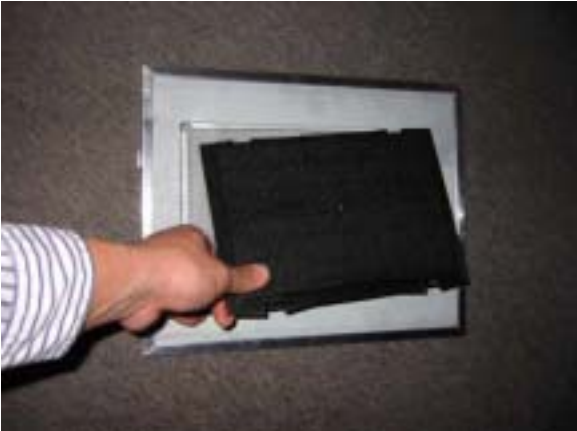
3. Install carbon filter onto metal bracket with plastic side up. Insert bottom side of carbon filter where the tab cut-outs are first.