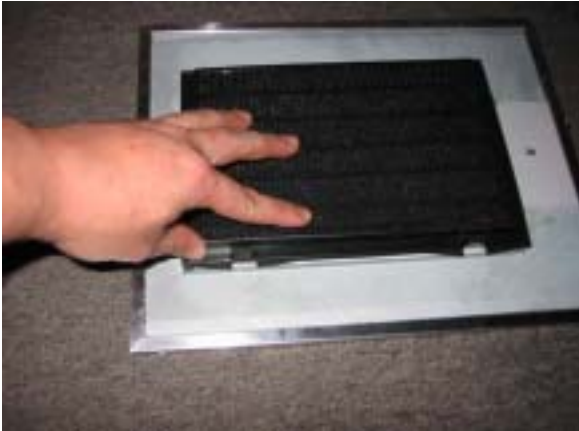
4. Push carbon filter down and click locking tabs in place.