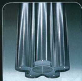
Dada The wavy stainless steel surface of the Trim 16LR hood by Dante Bonucelli makes a dramatic statement (47" h x 26" dia, not yet priced; DadaWeb.it).