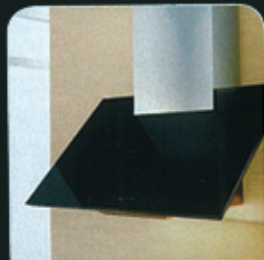
Zephyr This stainless steel Plane hood by Robert Brunner features hidden halogen lighting and a black glass surface (36" h x 36" w, $2,400; ZephyrOnline.com).