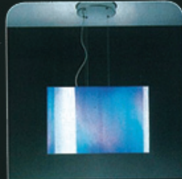
Artemide The Italian lighting company's Tian Xia Air has a polished aluminum finish and remote control (available early 2009; not yet priced; Artemide.com).