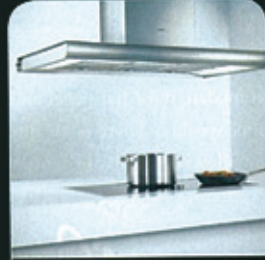
Gaggenau Using jet engine technology, the edges of the Coanda hood create an air curtain that inhibits smoke and reduces noise (48" l, $3,500; Gaggenau-USA.com).