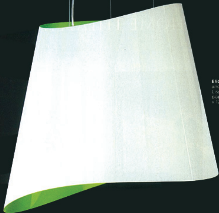
Elica The Oia stainless steel and enamel hood by Lorenzo Lispi and Fabrizio Crisa adds a pop of unexpected color (21" h x 12 7/8" dia, $1,800; Elica.com).