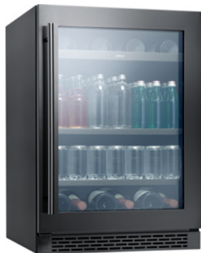
PRB24C01ABSG - single zone beverage 24" Compact / Built-in / Freestanding