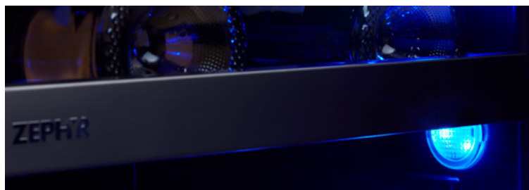
3-Color LED Lighting