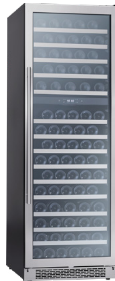
PRW24F02BG - dual zone 24" Full-Size / Built-in / Freestanding

Capacity: 148 bottles (750 ml) Capacity: 132 bottles (with display rack) 40° - 65°F 41 dBA 69-1/2" - 70" height range Stainless steel + glass door Field-reversible door Zero-clearance door hinge Electronic capacitive touch controls 13 full-extension, black wood racks with stainless steel trim 1 full-extension rack, convertible to a 5-bottle display rack 1 half capacity wood rack Easily stores large diameter bottles Sabbath mode