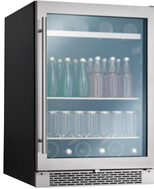
PRB24C01BG - single zone 24" Compact / Built-in / Freestanding

Capacity: 4 bottles (750 ml), 62 12oz cans 34° - 50°F 39 dBA 34-3/16" - 34-9/16" height range Stainless steel + glass door Field-reversible door Electronic capacitive touch controls 1 full-extension, black wood rack with stainless steel trim 2 adjustable, transparent-gray glass shelves with airflow openings Sabbath mode