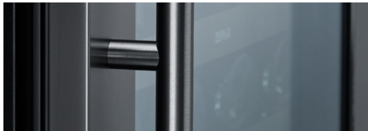
Black Stainless Steel Handle

Capacity: 44 bottles (750 ml) 39° - 64°F 39 dBA 34" - 34-1/2" height range Black stainless steel + glass door Field-reversible door Zero-clearance door hinge Electronic capacitive touch controls Door open alarm 5 full-extension, black wood racks with black stainless steel trim Easily stores large diameter bottles Dual evaporators Sabbath mode