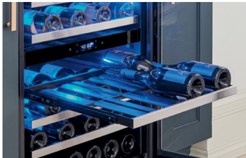
Full-Extension, Black Wood Racks