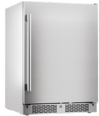
PRB24C01AS-OD - single zone outdoor 24" Compact / Built-in / Freestanding