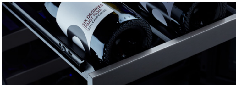
Easily stores large diameter bottles on the designated 7-bottle capacity racks