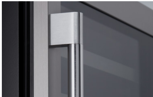
Optional Pro-Style Handle Accessory*