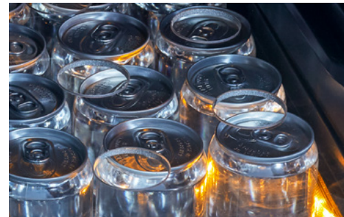
Adjustable, Transparent-Gray Glass Shelves with Airflow Openings**