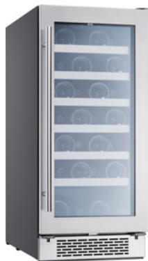
PRW15C01AG - single zone 15" Compact / Built-in / Freestanding