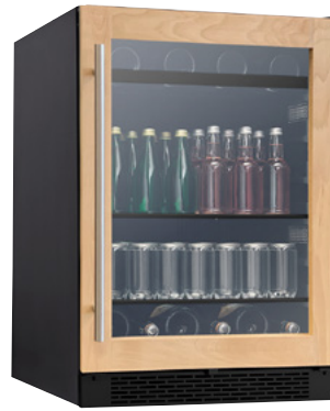
PRB24C01BPG - single zone panel-ready* 24" Compact / Built-in / Freestanding

Capacity: 7 bottles (750 ml), 112 12oz cans 34° - 50°F 39 dBA 33-7/8" - 34-1/2" height range Stainless steel + glass door Field-reversible door Electronic capacitive touch controls 1 full-extension, black wood rack with stainless steel trim 2 adjustable, transparent-gray glass shelves with airflow openings Easily stores large diameter bottles Sabbath mode