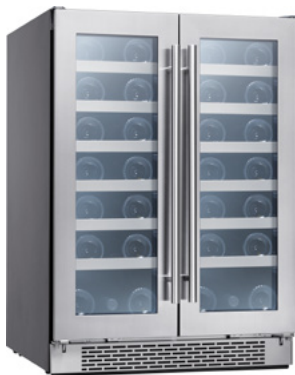
PRW24C32BG - dual zone wine 24" Compact / Built-in / Freestanding

Capacity: 21 bottles (750 ml), 64 12oz cans 40° - 65°F (wine side) 34° - 65°F (beverage side) 38 dBA 33-7/8" - 34-3/8" height range Stainless steel + glass door Zero-clearance door hinge Electronic capacitive touch controls 6 full-extension, black wood racks with stainless steel trim 3 adjustable, transparent-gray glass shelves with airflow openings Easily stores large diameter bottles Dual evaporators Sabbath mode