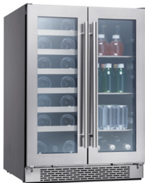
PRWB24C32BG - dual zone wine & beverage 24" Compact / Built-in / Freestanding