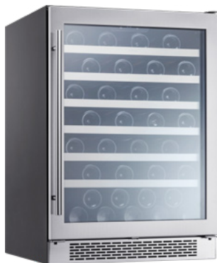
PRW24C01BG - single zone 24" Compact / Built-in / Freestanding

Capacity: 28 bottles (750 ml) 40° - 65°F 39 dBA 34-3/16" - 34-9/16" height range Stainless steel + glass door Field-reversible door Electronic capacitive touch controls 6 full-extension, black wood racks with stainless steel trim Sabbath mode