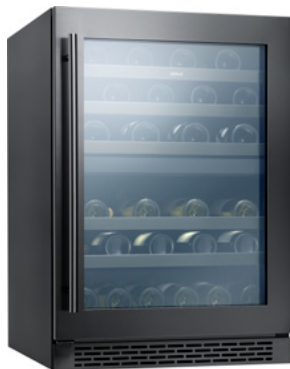
PRW24C02ABSG - dual zone wine 24" Compact / Built-in / Freestanding