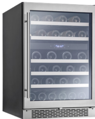
PRW24C02BG - dual zone 24" Compact / Built-in / Freestanding

Capacity: 53 bottles (750 ml) 40° - 65°F 39 dBA 33-7/8" - 34-1/2" height range Stainless steel + glass door Field-reversible door Electronic capacitive touch controls 6 full-extension, black wood racks with stainless steel trim Easily stores large diameter bottles Sabbath mode