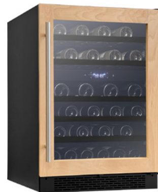
PRW24C02BPG - dual zone panel-ready* 24" Compact / Built-in / Freestanding

Capacity: 45 bottles (750 ml) 40° - 65°F 39 dBA 33-7/8" - 34-1/2" height range Stainless steel + glass door Field-reversible door Electronic capacitive touch controls 5 full-extension, black wood racks with stainless steel trim Easily stores large diameter bottles Dual evaporators Sabbath mode