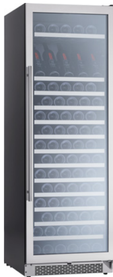
PRW24F01BG - single zone 24" Full-Size / Built-in / Freestanding