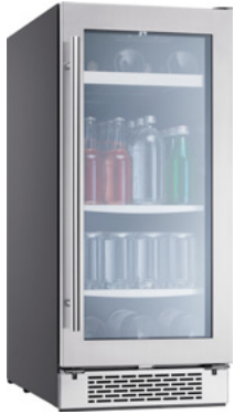
PRB15C01AG - single zone 15" Compact / Built-in / Freestanding