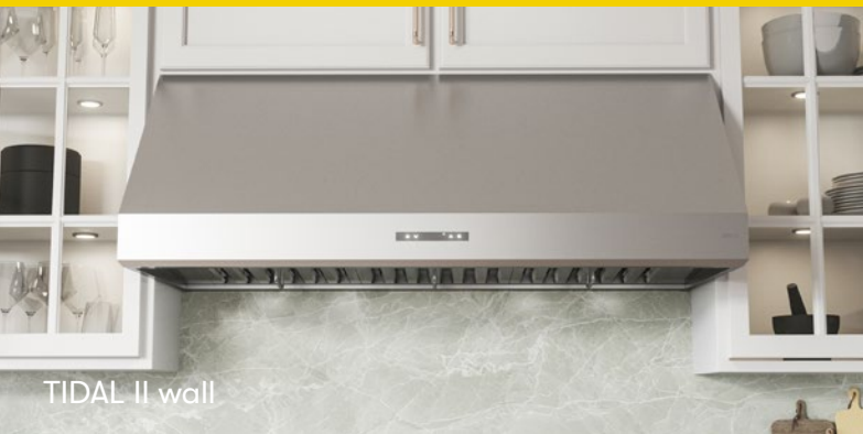
TIDAL II wall

Designed for the ultimate pro-style kitchen, Tidal I and Tidal II hoods feature optional dual 1300-CFM PowerWave™ blowers, Zephyr Connect capabilities, and professional baffle filters. The next wave of the future, Tidal I and II are equipped with LumiLight LED Lighting and 6-Speed Proximity Touch Controls.