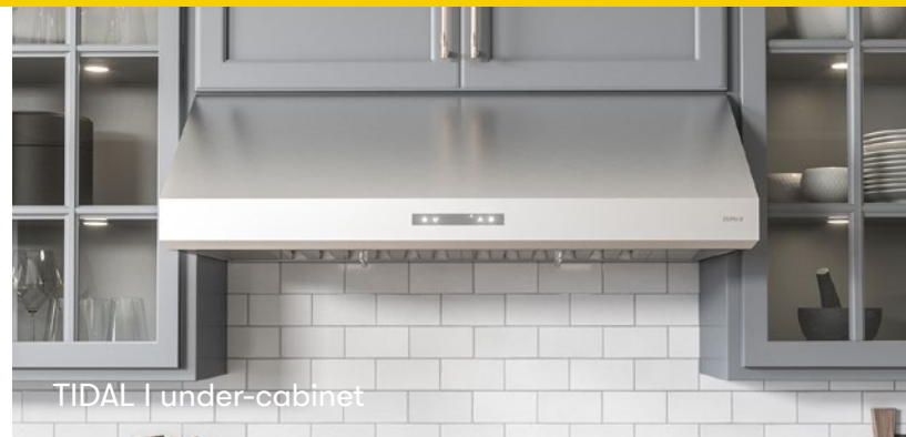
TIDAL I under-cabinet