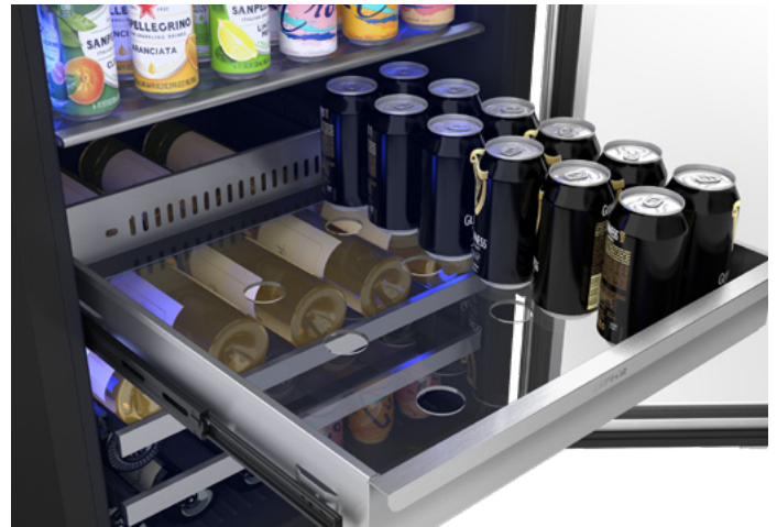
Full-Extension Stainless Steel Rollout Bin with Transparent-Gray Glass