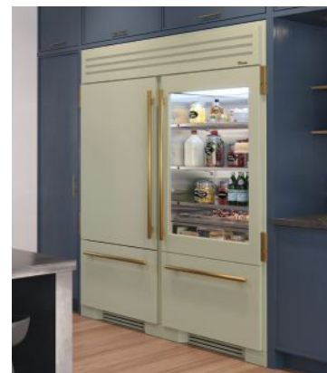
True Residential has launched a 36" Refrigerator with a Bottom Freezer available in both solid and glass door options. Offering a 300-series stainless steel interior with 22.6 cu. ft. of space, the unit features adjustable/removable half- and full-width glass shelves and soft-close produce bins. true-residential.com

Other trends include attention to environmental concerns; increased use of color, texture and mixed materials, and a desire for personalized functional features. That's according to manufacturers recently surveyed by Kitchen & Bath Design News .