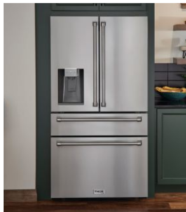
THOR Kitchen's 36" Professional French Door Refrigerator features 22 cu. ft. of flexible storage and an in-door ice and water dispenser. The counter-depth unit includes state-of-the-art cooling technology and Flex Drawer, a third climate-controlled drawer with separate zones. thorkitchen.com