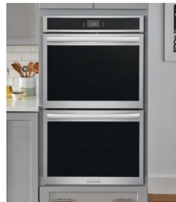
The Frigidaire Gallery Wall Ovens, available in single and double versions, feature air fry, steam bake and slow cook functions. The ovens can start baking immediately with No Preheat, and boast touchscreen displays, tinted glass windows and 5.3-cu.-ft. capacities. frigidaire.com