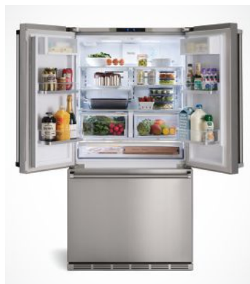
The 36" freestanding French Door Refrigerator with bottom freezer is now part of the 3 Series Collection from Viking Range . The refrigerator includes two Humidity Zone Drawers with Pro Fresh Technology that simulates natural light conditions, as well as IonGuard, which eliminates odors. vikingrange.com