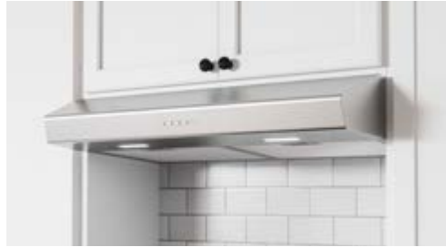
BREEZE II (AK12)

Its sophisticated features and performance set the industry standard for value. 3-speed mechanical controls and 250-CFM blower quietly clears the air while convenient dishwasher-safe aluminum filters remove airborne residues. Updated with dual-level LumiLight LED lighting. Available in black, white and stainless steel finishes. Size: 24", 30", 36" CFM: 250