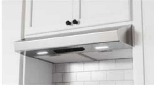
BREEZE I UNDER-CABINET (AK11)

Its sophisticated features and performance set the industry standard for value. 3-speed mechanical controls and 250-CFM blower quietly clears the air while convenient dishwasher-safe aluminum filters remove airborne residues. Updated with dual-level LumiLight LED lighting. Available in black, white and stainless steel finishes. Size: 24", 30", 36" CFM: 250