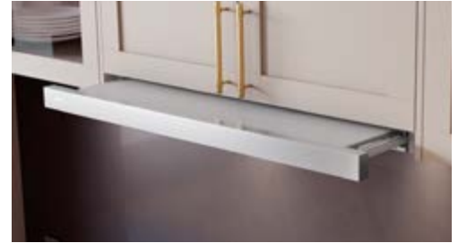
VALINA UNDER-CABINET (ZVA)

Quiet, discreet and efficient, the Valina Under-Cabinet is your kitchen's most clever secret weapon. With a retractable stainless steel visor that only appears when needed, and ambient LED lighting to let you focus on the tasks at hand, this hood is everything you need in one dynamic package.