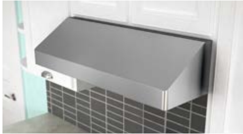
GUST UNDER-CABINET (AK71)

Classic, architectural lines meet at an apex to energize the familiar look of the chimney style under-cabinet hood. This expressive-yet-utilitarian design is upgraded with our Perimeter Aspiration System for the ultimate fusion of style and performance. Dual-level LumiLight LED lights illuminate the surface below while the 12" depth ensures a true fit with popular cabinet styles. Size 30", 36" CFM: 400, 290