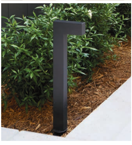
Details make the design. Hardware from Emtek served as the perfect finishing touch for everything from door hinges to cabinet hardware. Exterior lighting by Hinkley guides the way.